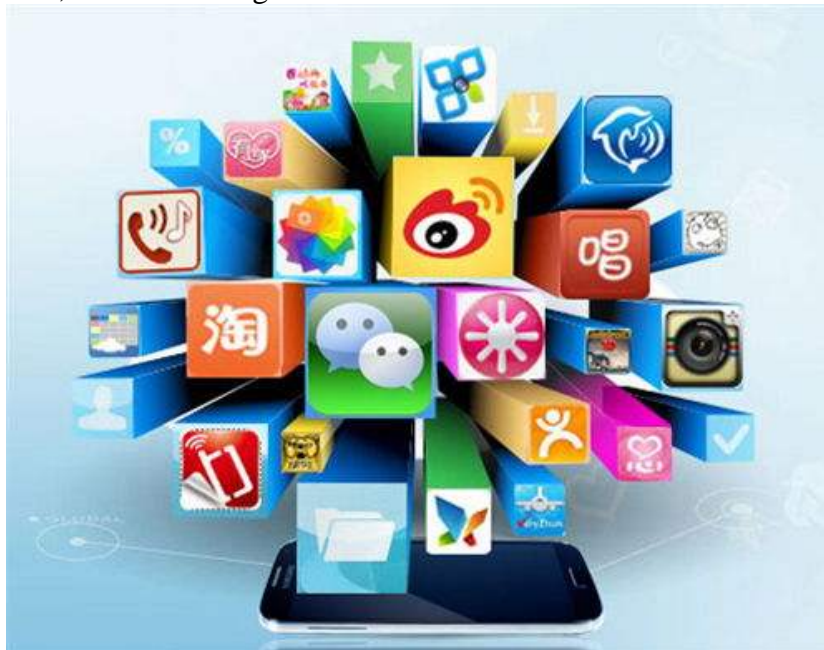
Figure 1 External information resources

communicate and interact, and release students' inner pressure somewhat, which is of great benefit to students' growth and development. In short, the development of new media, to achieve the construction of ideological and political education platform in colleges and universities. For example, the emergence of Weibo, WeChat, can enable students to obtain and master more external information resources, as shown in figure 1.