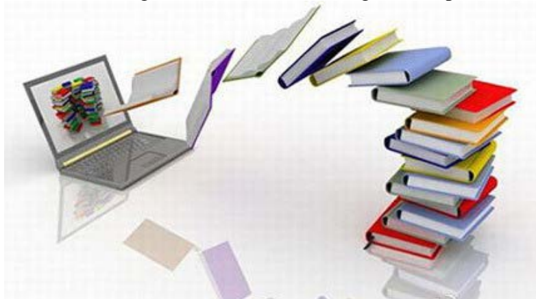
Figure 2 Transformation and updating of inherent teaching methods